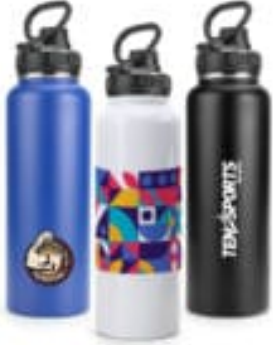
TM-D43 Stainless Steel Bottle Specifications: Product Size: 95 x 95 mm, Capacity: 1.15 Ltrs / 38 oz