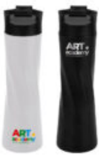
TM-D70 300ml slim waist design Double Wall SS bottle Specifications: Product Size: 76 x 270 x 78 mm