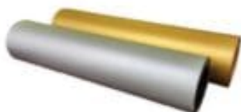
HTM-SF CAD Cut - PU T-Shirt Transfer Vinyl Specifications: Sports film for heat transfer paper