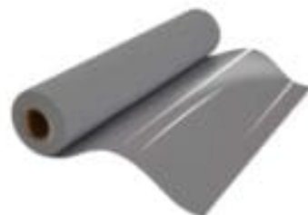
HTM-SF-SILVER CAD Cut - PU T-Shirt Transfer Vinyl Specifications: 50 cm x 100 cm (20 Wm / roll) - Silver