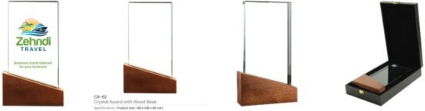
CR-62 Crystal Award with Wood Base Specifications: Product Size: 140 x 40 x 240 mm