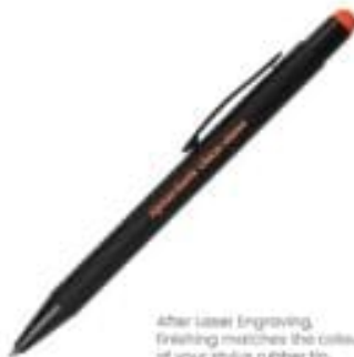
After Laser Engraving, Finishing matches the color of your stylus rubber tip.