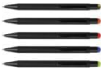
PN43 Stylus Metal Pen with Stylus - Color engraving Specifications: Black Rubberized metal barrel with black clip & tip.