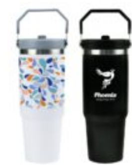
TM-042 SS Tumbler with handle and straw Specifications: Product Size: 100 x 240 x 88 mm