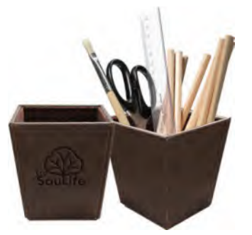
Pen / Pencil Holder

Below are the available material & colors