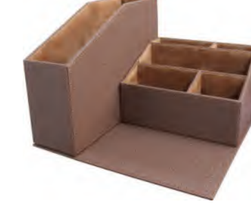
Office Desk Organizer