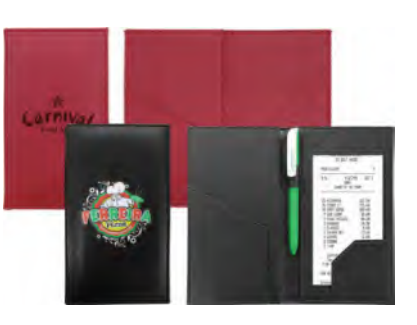
Restaurant Bill Folder

Below are the available material & colors