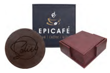
Leather Tea Coaster