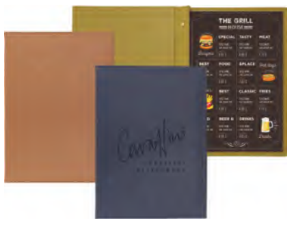
Menu Cover with Screw