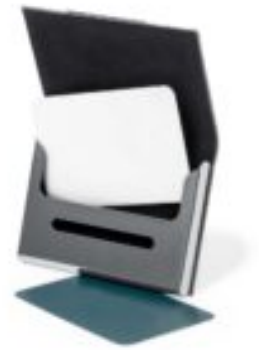
BCH-04-GRY RPET Fabric & Metal Business Card Holder Specifications: Product Size 95 x 65 x 15mm