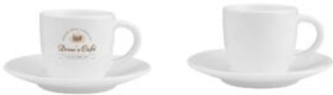
MU-CE187 White Sublimation Cup and Saucer Specifications: Packing Size: 100 x 100 x 60 mm, Capacity: 100 ml