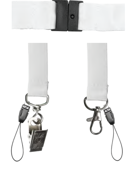
20mm Lanyard w/Safety Hook